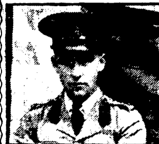
The author at the time of the Dowager Empress's visit.

"This must be a long letter, copied by my A.D.C., so there is no danger of others knowing its contents. On Saturday afternoon, 12th inst., I heard H.M.S. Marlborough with 30 Royalties and retainers was due on Tuesday 15th inst., and as we were living at San Antonio there was no time to spare, for my wife and I felt this Palace, from its solitude and perfect surroundings, the Gardens in full bloom, should be their residence. Later on came your Cable, saying the King suggested San Antonio. My wife rose to the occasion and by Monday morning we were in Valletta Palace, and she working from morn to midnight, had so arranged everything that by Tuesday morning at 9 a.m. I found all in order, the Guard mounted and two sentries on the main entrance. Imagine my feelings on finding on my return to Valletta the Marlborough would not arrive until 20th, or 22nd, with a cargo of 30