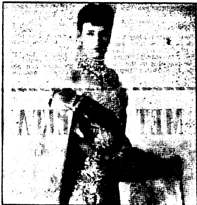
The Dowager Empress Marie Feodorovna

"Empress Marie with attendants 3 women, 3 men. Grand Duchess Xenia and 5 children with attendants 6 women and 1 man. Prince and Princess Yousouff senior, with attendants 4 women 3 men. Prince and Princess Yousouff junior and 1 child. Princess Orloff and Prince and Princess Orloff junior, and 1 child with attendants 4 women. Princess Dolgourouki, Prince Dolgourouki and 2 children with attendants 3 women and 1 man. Princess Obolensky, Maid of Honour. Admiral Prince and Princess Wlasemsky. Countess Mengden and Mademoiselle Everinoff. Ladies-in-Waiting, with attendants 3 women. Colonel Prince Orbellani, General and Madame Chatelain and 1 child. General Foguel. (Total ?) 20 Personages including 10 children and 31 attendants. Attendants include 3